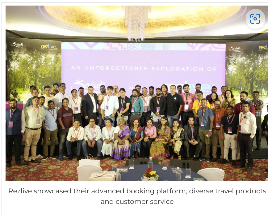
Rezlive showcased their advanced booking platform, diverse travel products and customer service

RezLive recently conducted a roadshow in Bhubaneswar, capital of Odisha, to promote diverse offerings of the Kingdom of Saudi Arabia to local travel trade agents.